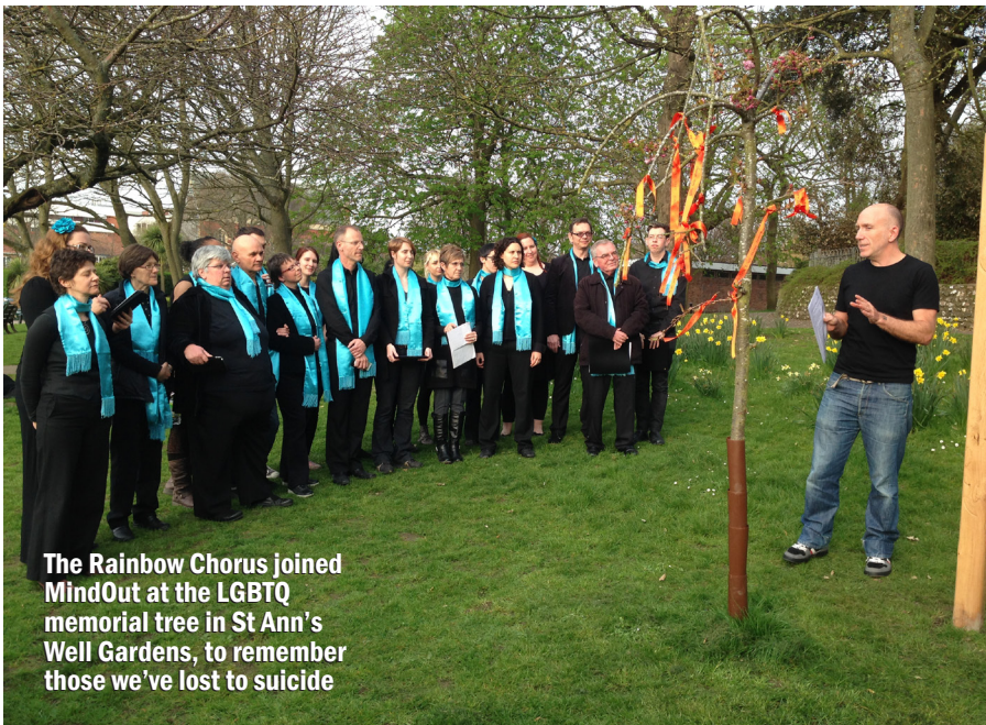
The Rainbow Chorus joined MindOut at the LGBTQ memorial tree in St Ann's Well Gardens, to remember those we've lost to suicide