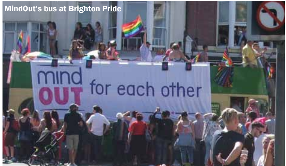
MindOut's bus at Brighton Pride