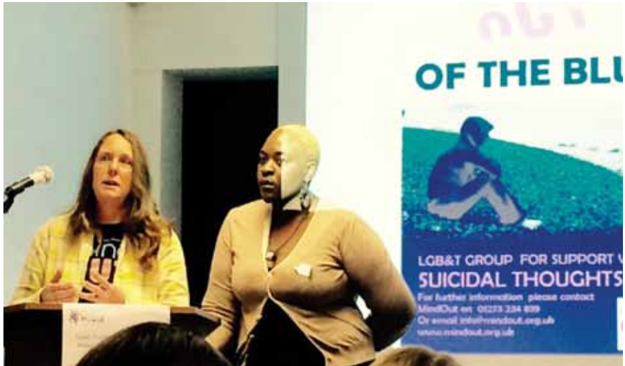
MindOut volunteers at the Suicide Prevention conference in Newcastle

We helped to facilitate community development initiatives in East London and ran a suicide prevention conference in Newcastle. We also provided LGBTQ Affirmative Practice training for the Mind Infoline and Legal Line workers in Manchester.