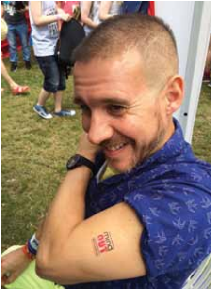
Anti-stigma volunteering (above) and the MindOut allotment (right)